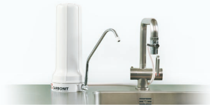
CARBONIT® SANUNO tabletop filters: inexpensive, flexible, quick to install.

Simple. Safe. Practical. Good. Carbonit Filters in your kitchen.