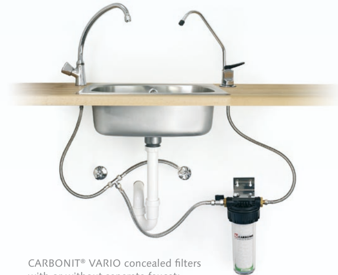
CARBONIT® VARIO concealed filters with or without separate faucet: easy to use, just the way you like it.